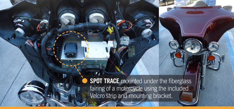
● SPOT TRACE mounted under the fiberglass fairing of a motorcycle using the included Velcro strip and mounting bracket.